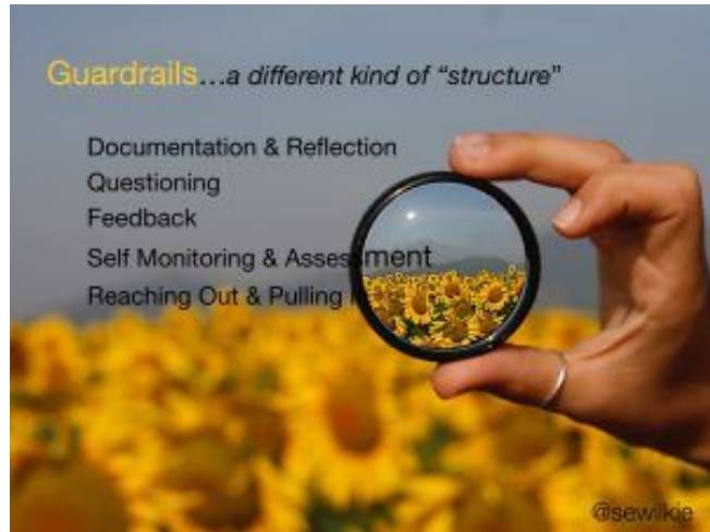
Guardrails: a process tool for learners